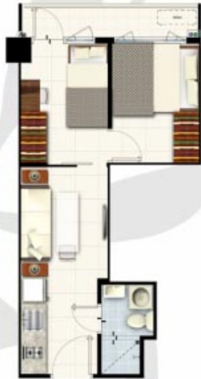
2 BEDROOM FAMILY SUITE A WITH BALCONY (29.65 SQM)

Experience relaxed mornings where you take in the views of the vast pools & greens right from your own balcony. Field Residences offers a variety of luxurious living spaces with option to combine so you can come home to a spacious unit where there's always room to grow.