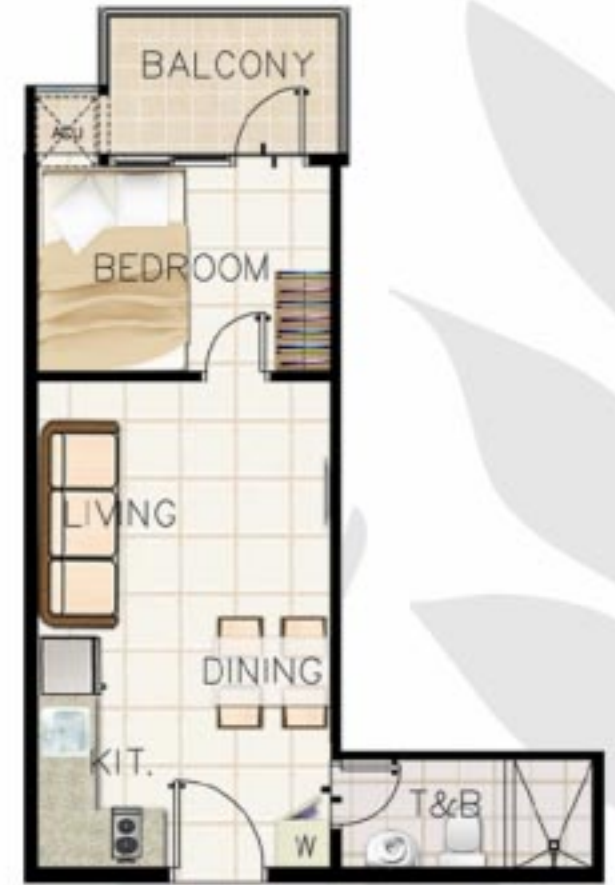
1 BEDROOM UNIT WITH BALCONY B (32.21 SQM)