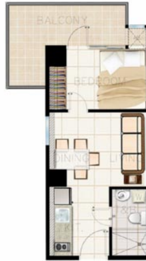
1 BEDROOM UNIT WITH BALCONY A (35.57 SQM)