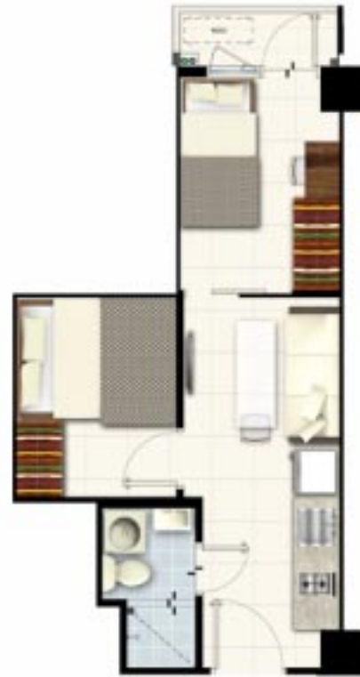
2 BEDROOM FAMILY SUITE B WITH BALCONY (27.76 SQM)